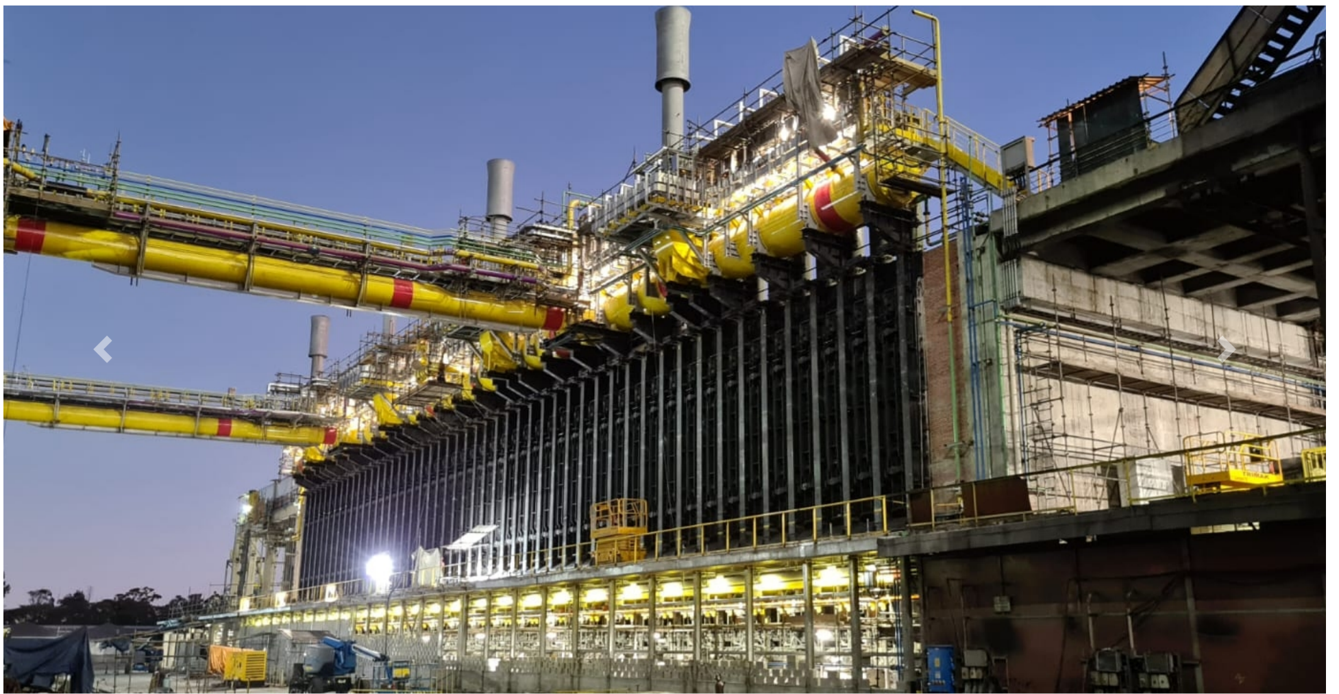
New coke oven battery

The bottom line: thyssenkrupp Uhde's DNA has been shaped by the innovative engineering mind and entrepreneurial spirit that characterized Carlos Otto and Friedrich Uhde as they set up their own firms 150 and 101 years ago. Today's workforce is determined to keep their pioneering spirit alive at the only company in the world to offer, supply and commission coke oven plants of a wide variety of designs from a single source – and to work on emission reduction and climate protection.